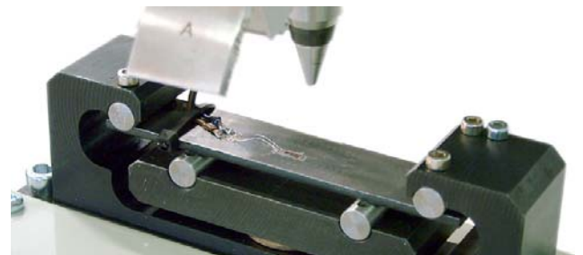
Measuring elasticity constant using strain gages.

In the X-ray elasticity constant determination process the test specimen is bent applying load that changes in steps. XSTRESS 3000 system makes a normal stress measurement during each step. From each measurement X3000 software calculates the change in interplanar spacing as function of known bending stress. From this the X-ray elasticity constant is determined.