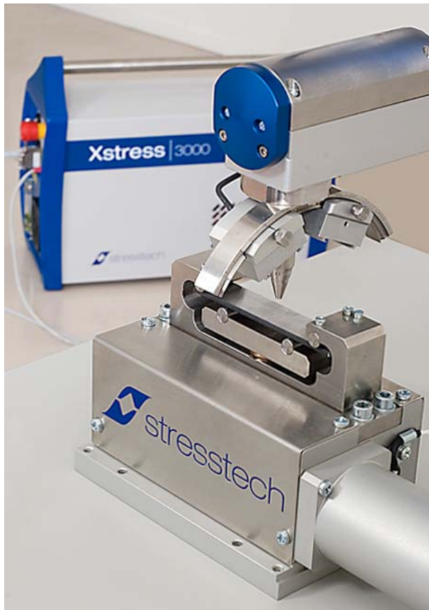
Elasticity constant device (four-point bending device).

Using experimentally determined X-ray elasticity constant is recommended for improving the X-ray stress measurement accuracy. This constant is needed for calculating the stresses from lattice strains. Experimental determination of the constant is now possible with the XSTRESS 3000 X-ray elasticity constant determination system developed by Stresstech.